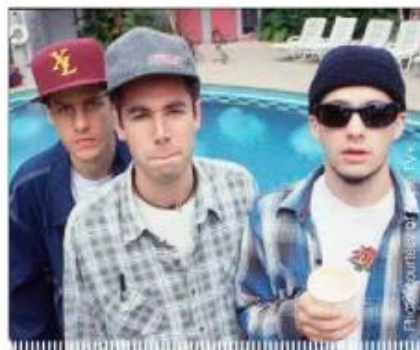
The Beastie Boys

When our blind item's singing a different tune, we've definitely come to the end of yet another column. Speaking of tunes, we survived the total eclipse of the sun. I don't know about elsewhere, but in Boston it got a bit overcast for half an hour. Certainly nothing worth waking Bonnie Tyler up for—which begs the question, where is she? While I look into that, you can check out www.BillyMasters.com , the site that isn't opposed to kissin' cousins. If you have a question, send it off to Billy@BillyMasters.com and I promise to get back to you before someone offers to pay Wynonna for sex! So, until next time, remember, one man's filth is another man's bible.