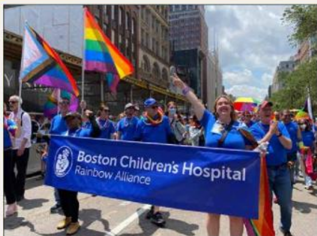
Boston Pride Parade 2023.