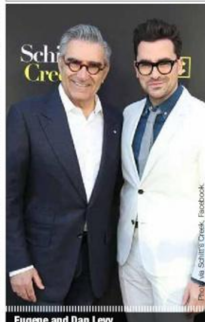
Eugene and Dan Levy