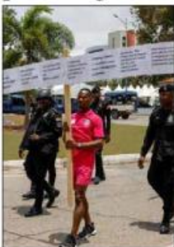
Texas Kadri Moro protests on the street of Accra, Ghana, Thursday Sept 12, 2024.