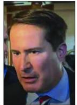
Congressman Seth Moulton.

MassEquality challenged Moulton's terminology in a state-