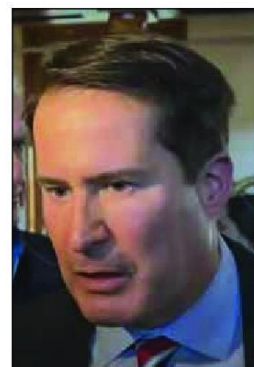
Congressman Seth Moulton.

MassEquality challenged Moulton's terminology in a state-