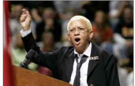
Virginia Tech English Professor, Nikki Giovanni speaks closing remarks at a convocation to honor the victims of a shooting rampage at Virginia Tech in Blacksburg, Va., on April 17, 2007.