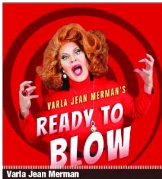
Varla Jean Merman

When anyone is wearing a sock to a gay orgy, it's definitely time to end yet another column. Obviously it wasn't mo! To paraphrase someone famous —I've known orgies, and that's no orgy. But you can find more than your fill at www.BillyMasters.com —the site that's like a virtual orgy —but you won't lose your socks! If you have a gap that only I can fill, send specifics (and photos) to Billy@BillyMasters.com , and I promise to get back to you before someone invites Jared Padalecki to an orgy! Until next time, remember, one man's filth is another man's bible.