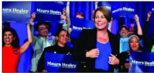
Gubernatorial candidate and Massachusetts Attorney General Maura Healey addresses the audience at a watch party, Tuesday, Sept. 6, 2022, in Boston