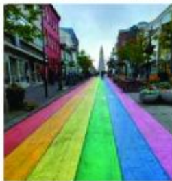
Photo of Regnbogagatan (Rainbow Street) in Reykjavik, Iceland.

by Dana Rudolph | drudolph@mombian.com contributing writer