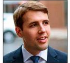
New Hampshire Congressman Chris Pappas (D).

Meanwhile, in Colorado, Polis appears poised to win his second term as governor, with polls showing him with an 18-point lead or higher over his Republican challenger.