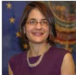
State Senator Becca Balint (D).