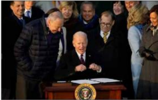
President Joe Biden signs the Respect for Marriage Act, Tuesday, Dec. 13, 2022, on the South Lawn of the White House in Washington.

"I got in trouble," Biden joked of that moment. Three days later, Obama him-