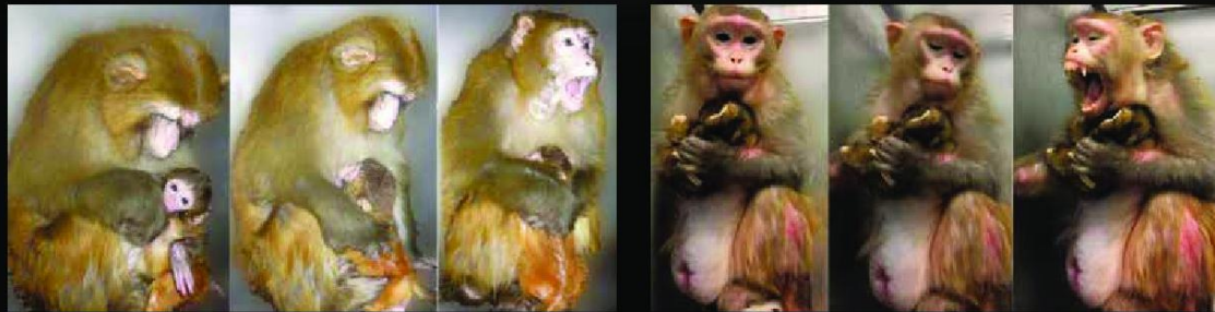
"Monkey images," Figures 1 and 2 in Tigers for Meat by Michael J. Fox and James S. Kingstone (doi:10.1371/journal.pone.0141922.g001) | CC BY-NC-ND (doi:10.1371/journal.pone.0141922.g001)