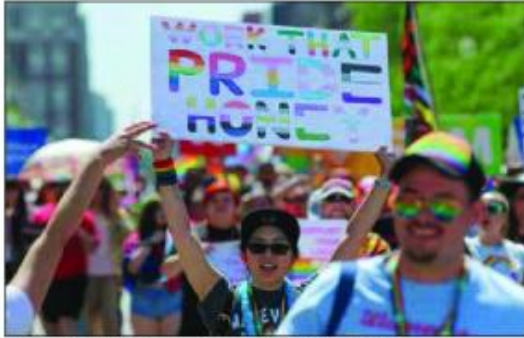
Boston Pride 2019.

BOSTON – Boston Pride For The People (BP4TP) announced the return of a Pride Month celebration in Boston. The celebration will be held in June 2023, and will include a parade, a festival, block parties, and more. The parade and festival will take place on Saturday, June 10th on Boston Common and at City Hall Plaza. Other activities will