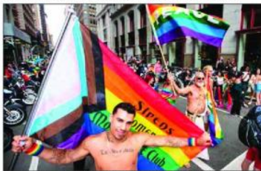
Revelers wait for the start of the NYC Pride March Sunday in New York.