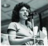
Emcee at Pride 1981

30 Years Providing Skilled Adoption Services to the LGBTQ+ Community Still Fighting for Our Rights