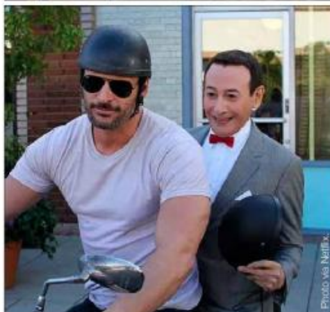
Joe Manganiello & Pee-wee Herman