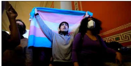
LGBTQ+ rights supporters rally in the hallway outside an Iowa House Judiciary subcommittee hearing, Wednesday, Jan. 31, 2024, at the Statehouse in Des Moines, Iowa. The rights of LGBTQ+ people continue to be in flux across the U.S. with a new flurry of developments.