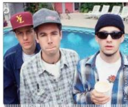
The Beastie Boys

When our blind item's singing a different tune, we've definitely come to the end of yet another column. Speaking of tunes, we survived the total eclipse of the sun. I don't know about elsewhere, but in Boston it got a bit overcast for half an hour. Certainly nothing worth waking Bonnie Tyler up for— which begs the question, where is she? While I look into that, you can check out www.BillyMasters.com , the site that isn't opposed to kissin' cousins. If you have a question, send it off to Billy@BillyMasters.com and I promise to get back to you before someone offers to pay Wynonna for sex! So, until next time, remember, one man's filth is another man's bible.