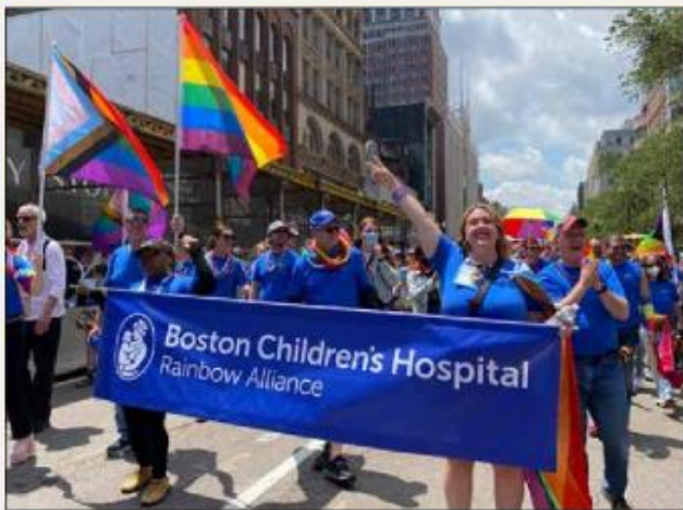
Boston Pride Parade 2023.