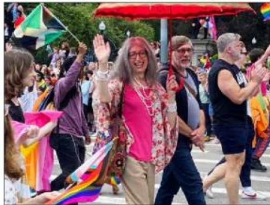
Boston Pride Parade 2023.

be completed online via Eventbrite, where interested parties will reserve their place in the parade and/or space at the festivals. Registration fees and payment options are outlined at