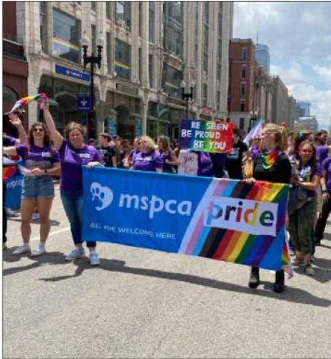
Boston Pride Parade 2023.

Boston Pride For The People (BP4TP) is the volunteer and community-run non-profit organization working to empower, celebrate, commemorate, and educate in partnership with Boston's LG-BTQ+ communities. In 2023 BP4TP hosted and managed Boston's first Pride parade and festivals in more than three years, bringing New England's largest Pride parade back to its home in Boston. For more information visit: bostonprideforthepeople.org .