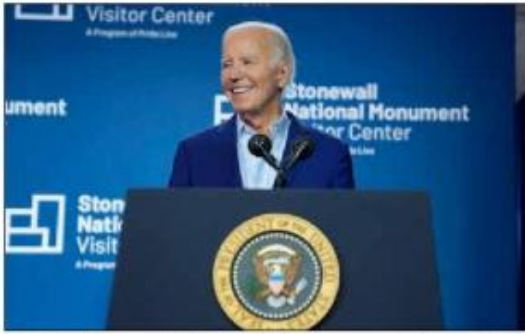
President Joe Biden speaks at the grand opening ceremony for the Stonewall National Monument Visitor Center, Friday, June 28, 2024, in New York.