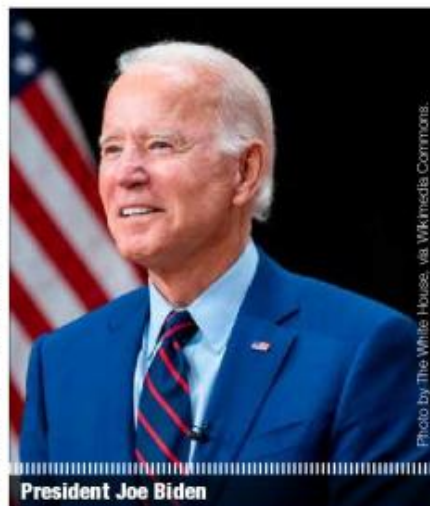
President Joe Biden

When actors can make half a mil a minute, it's time for me to consider changing professions and end yet another column. And I thought Stormy Daniels had a good payday! I'm getting a bit hot under the collar—but that could be because it's been around 100 degrees every day during this trip. My God, it feels as if they've already started the cremation process. While I try to cool off, you can check out www.BillyMasters.com —the site that's always steamy. If you have a question for me, dash it off to Billy@BillyMasters.com and I promise to get back to you before J.D. Vance changes his name...again! Until next time, remember, one man's filth is another man's bible.