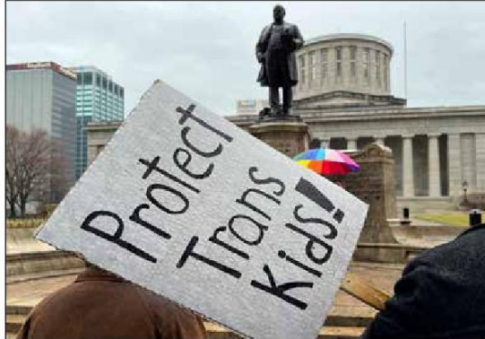
Demonstrators advocating for transgender rights and healthcare stand outside of the Ohio Statehouse, Jan. 24, 2024, in Columbus, Ohio. A federal appeals court on Wednesday, July 17, refused to lift a judge's order temporarily blocking the Biden administration's new Title IX rule meant to expand protections for LGBTQ+ students.