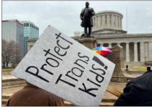
Demonstrators advocating for transgender rights and healthcare stand outside of the Ohio Statehouse, Jan. 24, 2024, in Columbus, Ohio. A federal appeals court on Wednesday, July 17, refused to lift a judge's order temporarily blocking the Biden administration's new Title IX rule meant to expand protections for LGBTQ+ students.